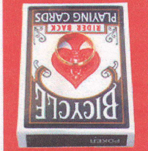
Original Joker Magic

A borrowed ring is placed on top of a card box. Picking up a playing card, the magician waves it over the ring. The ring promptly disappears. The magician picks up the card box and shakes it. A rattling sound is heard. He opens the box and tips it, the ring slides out of the card box.